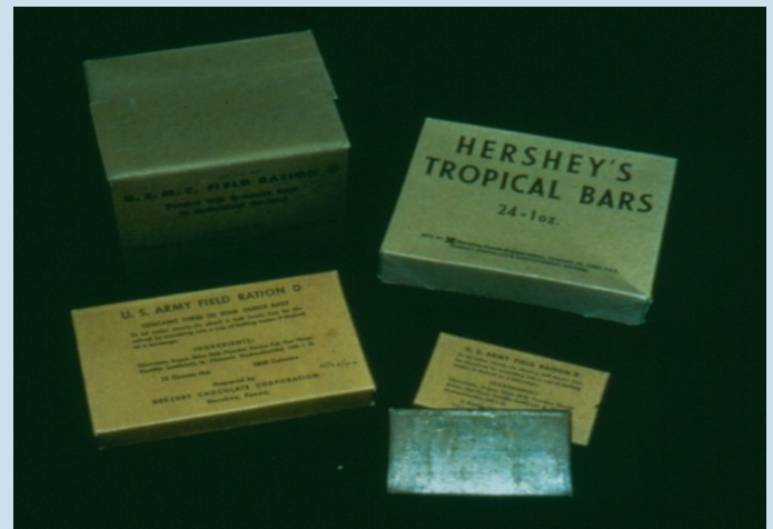
Packaging for the Ration D bar, 1942