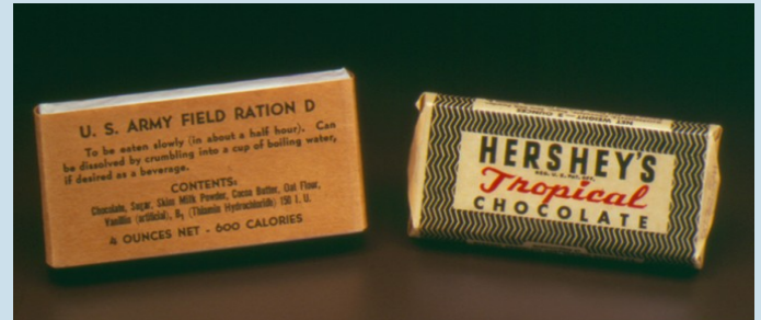
Ration D bar and Tropical Chocolate bar, 1942-1944

ceeding all production expectations in the manufacturing of an Emergency Field Ration. An honor not easily won nor lightly bestowed, this wartime honor recognized companies that consistently met high standards of quality and quantity in light of available resources.